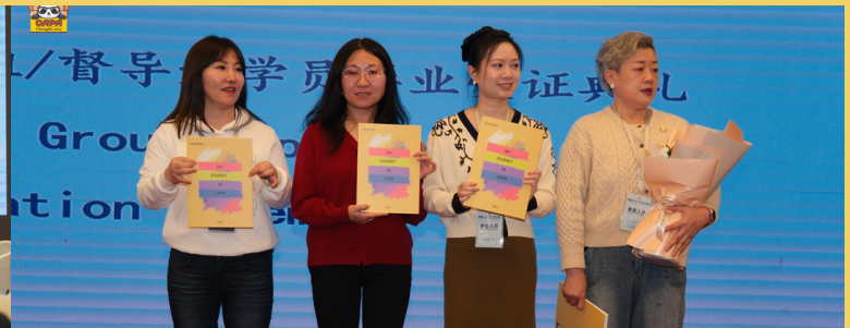
In-person Attendees of the 2023 Advanced Training Graduation