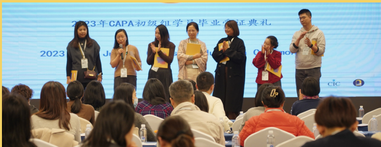
In-person Attendees of the 2023 Basic Training Graduation

Along with presentations and workshops, the annual CAPA graduation ceremonies were also held at the conference. Enjoy the 2023 Yearbook of compiled thoughts, comments and messages from students, teachers and supervisors.