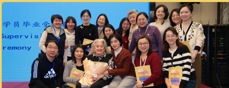
In-person Attendees of the 2023 Supervision Training Graduation