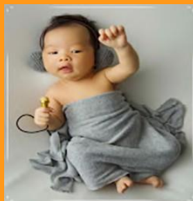
Future Capa Student