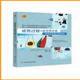
The Maturational Processes and Facilitating Environment By D.W. Winnicott