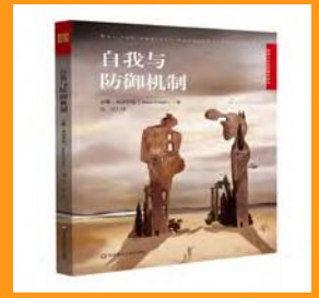
The Ego and the ID By Anna Freud