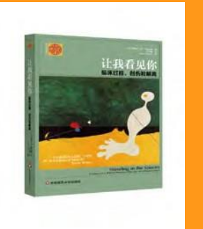
Introduction to the Practice of Psychoanalytic Psychotherapy By Ernest Becker