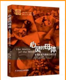
The Matrix of the Mind Practice By Thomas Ogden